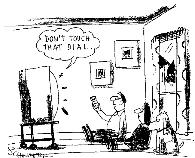
“What’s a dial?”

Often teachers presume that reporting multiple grades will increase their grading workload. But those who use the procedure claim that it actually makes grading easier and less work. Teachers gather the same evidence on student learning that they did when calculating an over-